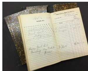
Just some of the donated items