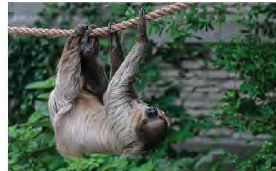
The Behind the Scenes tour of the sloth exhibit is available at Essex County Turtle Back Zoo.

Nature Play is playing WITH nature, not just IN nature and is a great way to interact with nature no matter your