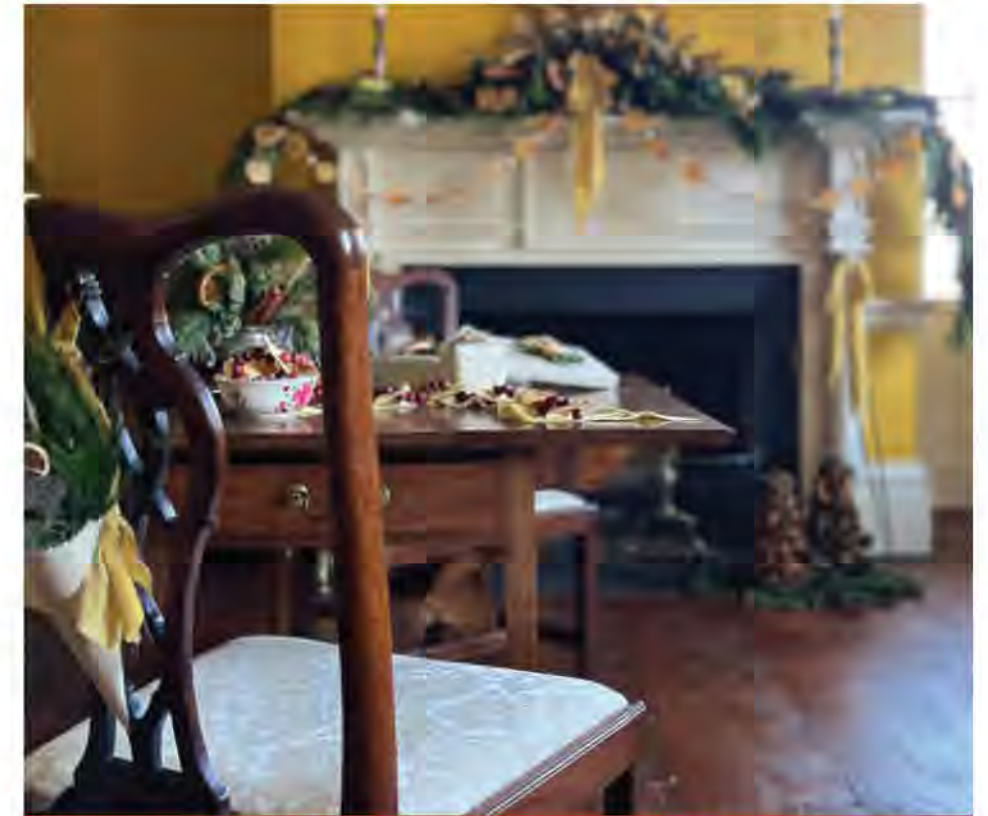
Holiday House Tours at the Crane House and Historic YWCA Museum

The Crane House & Historic YWCA museum is a historic house museum that explores the history of our country from its early years as