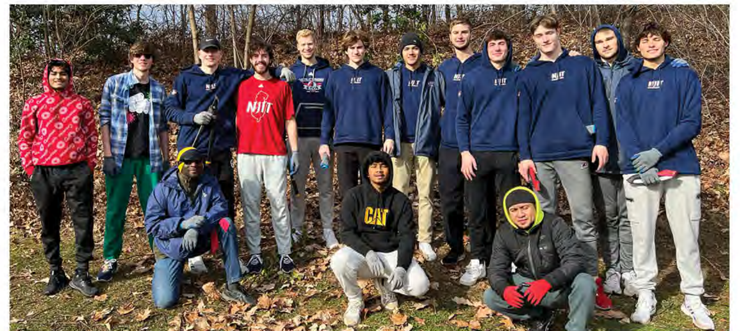
Winter volunteer stewardship in Essex County Branch Brook Park