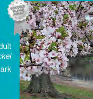
2nd Place -Adult Beth Calamia Scheckel Branch Brook Park