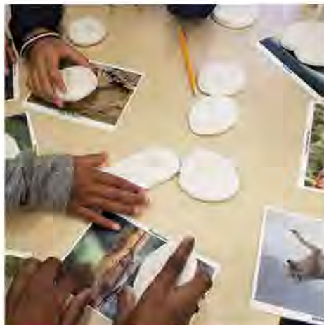
Wild about Wildlife at Essex County Environmental Center

Monday, January 27; 5:30-7pm For ages 6-11. Learn about these beautiful and mysterious silent hunters of the night. Discover what they are eating by carefully reconstructing the bones found inside owl pellets, while discussing predators and prey and food chain dynamics. Advanced registration