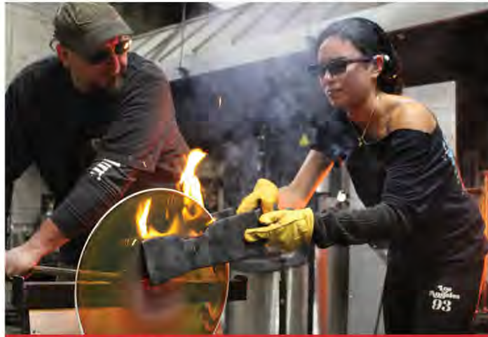
Glassblowing at Newark Glass Art Center

In 2020, USA Today readers voted the Crane House and Historic YWCA's Holiday House Tour #4 IN THE NATION. Be among the first to see this year's decorations as one of the Essex County Holiday House Tour sites. Visit us to see the beautiful period decorations by the Garden Club of Montclair. Self-guided tours let you explore this 227-year-old home at your leisure. Warm yourself in the hearth and learn about holiday food traditions. Stop in to the Nathaniel Crane House for unique holiday gifts! As a gift to our visitors this