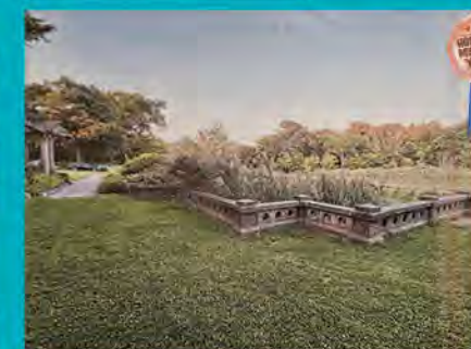
Honorable Mention -Youth Jaysiin Cespedes Branch Brook Park