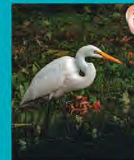
3rd Place -Youth Asher Gamble Egret Watsessing Park