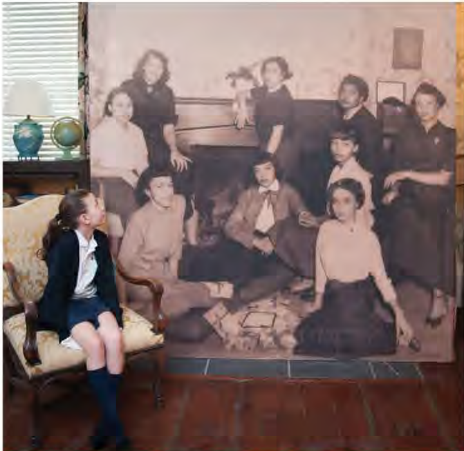
Self-Guided Tour Sundays at The Crane House & Historic YWCA