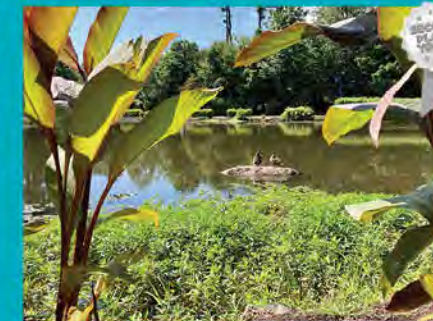
2nd Place -Youth Thomas Carey Orange Reservoir