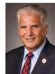
Joseph N. DiVincenzo, Jr. Essex County Executive and the Board of County Commissioners

Visit essexcountyparks.org for participating locations