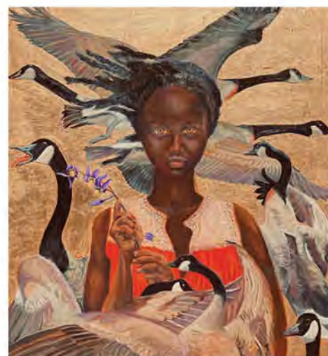
Oil painting by Sharon Sayegh

The following events are offered for the public's enjoyment by Essex County-based arts and history organizations.