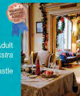
Honorable Mention -Adult Rachel Dykstra Kips Castle