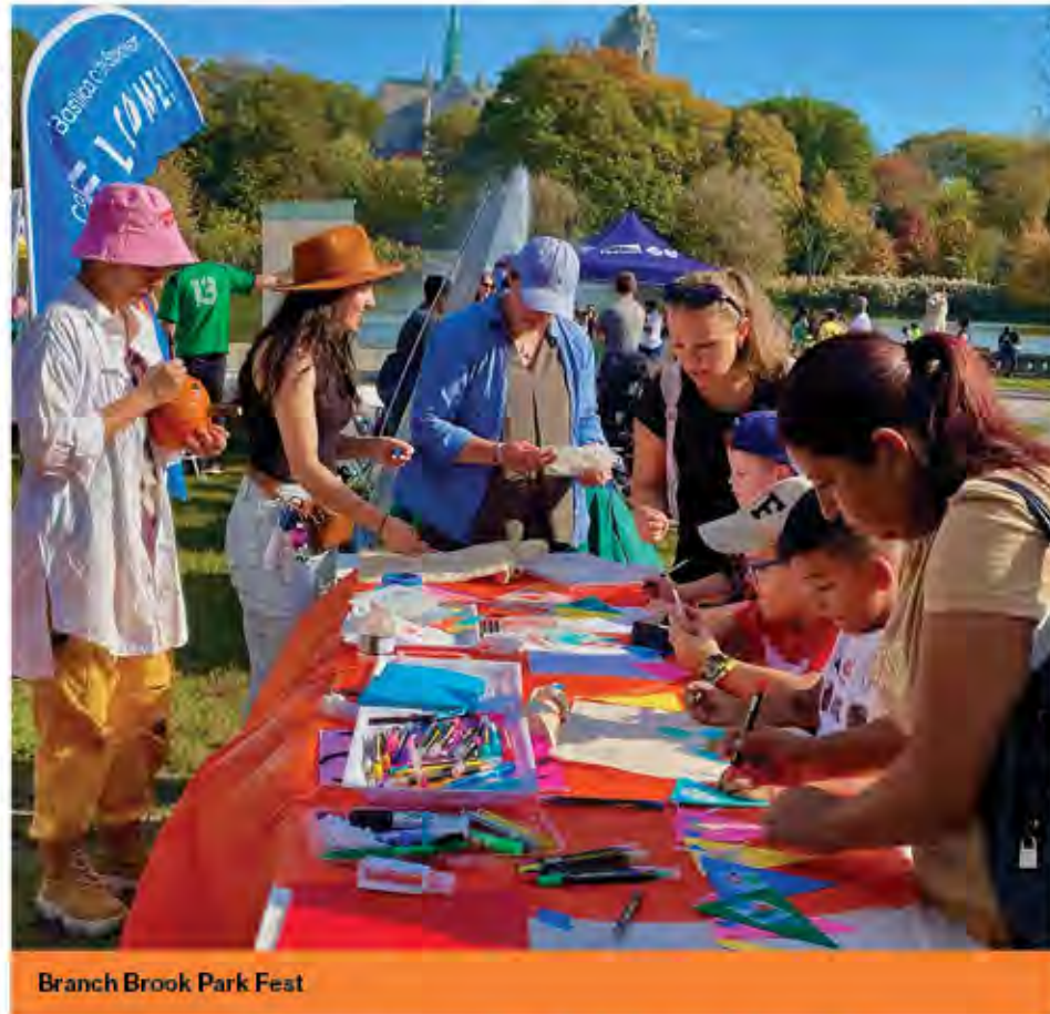
Branch Brook Park Fest

October 12: Branch Brook Park Fest: Join the Branch Brook Park Alliance for a day of free art projects, wellness resources and a series of free wellness events to include yoga, meditation, Zumba and Soul Line Dancing. Essex County Branch Brook Park, Prudential Concert Grove. 10am to 5pm. Free. Advanced registration is preferred.