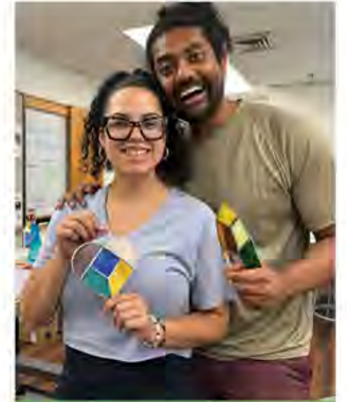
Glassmaking classes at GlassRoots, Newark

October 6: Voice of Nature: The Anthropocene with Renée Fleming. A breathtaking start to the 2024-2025 season with international superstar Renée Fleming. As fall colors flare, America's most celebrated soprano adds the exquisite hues of her own voice to this concert, inspired by her