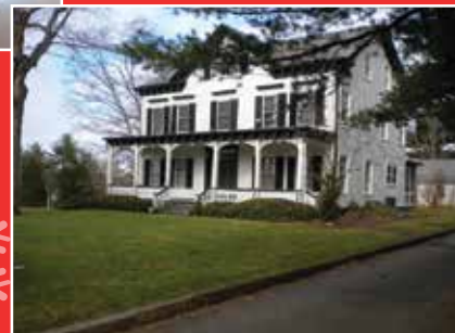
From top: Kingsland Manor, Essex County Kip's Castle, Van Tassel Funeral Home and Crane Homestead in West Caldwell.