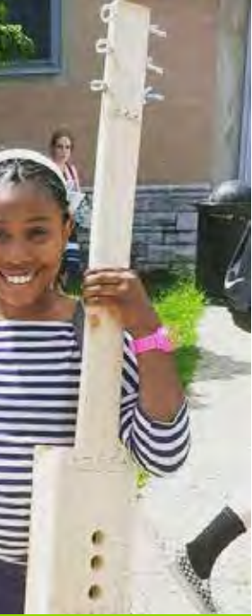
SOMA Children's Summer Program,