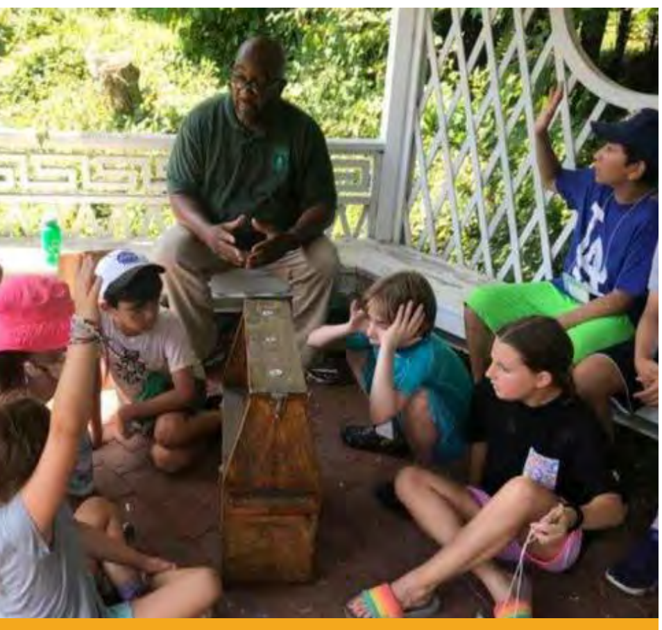
Montclair History Center Farm Camp

July 11-15; July 25-29; August 8-12; August 22-25. The Montclair History Center, Rutgers Cooperative Extension 4-H, and the Montclair Community Farms partner each year to host a fun, nature and history filled camp for youth to learn about our past, and from where our food comes. Our mission is to provide the best camp experience for youth, while also providing a beneficial learning experience about food, animals, our earth, and its agricultural past. For ages 6-11. Registration required in advance. Scholarships available. Counselor positions for ages 16+ and counselor-in-training positions for ages 12-15 are available. Crane House & Historic YWCA, 110 Orange Road, Montclair. 9am-12:30pm. $325. www.montclairhistory.org